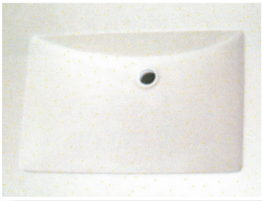
* Standard overflow